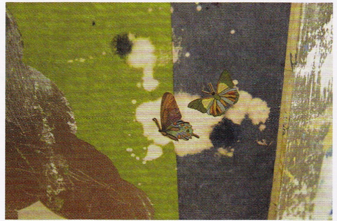
Dancing Butterflies by Valerie Bastit Laudier, Mixed media, 4 panels screen 26 x 66 cm each, 2010

present a rare, and poignant pictorial poetry found in today's fad-obsessed world".